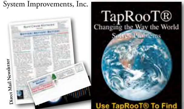
Direct Mail Newsletter