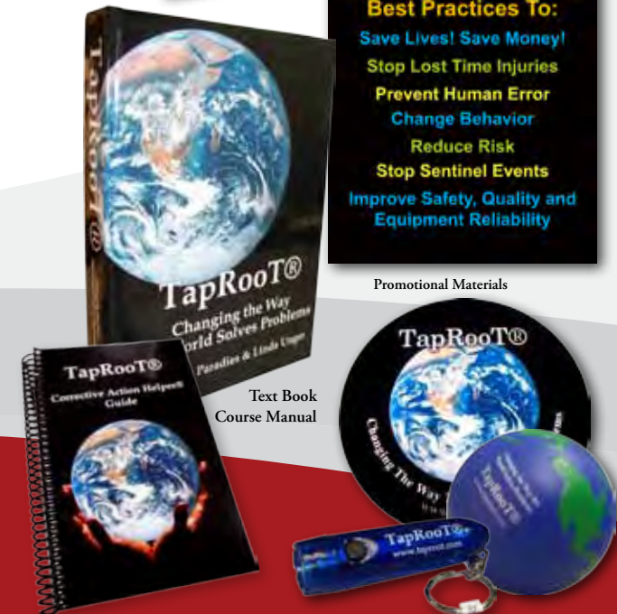
Text Book Course Manual